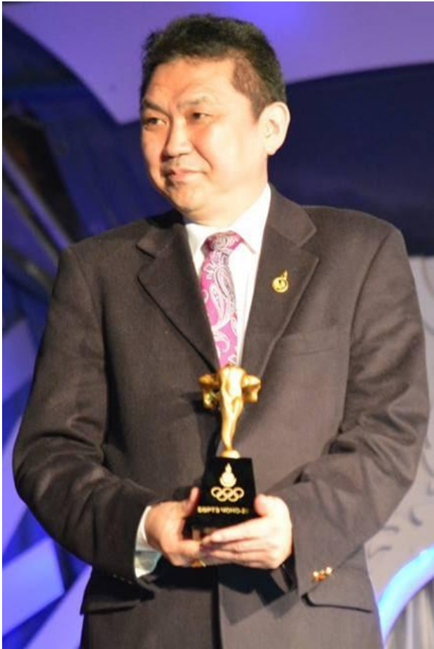
National Olympic Committee Award to Mongolian Chess Federation for our achievements